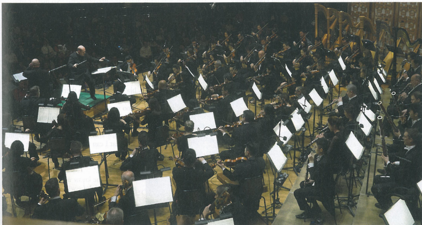
Jaap van Zweden puts the Hong Kong Philharmonic through their paces in Götterdämmerung , the final instalment in their Ring cycle which has been recorded for Naxos

'We were shaking – we didn't know how Harnoncourt would conduct. When you talk a lot, it's dangerous not to be ready'